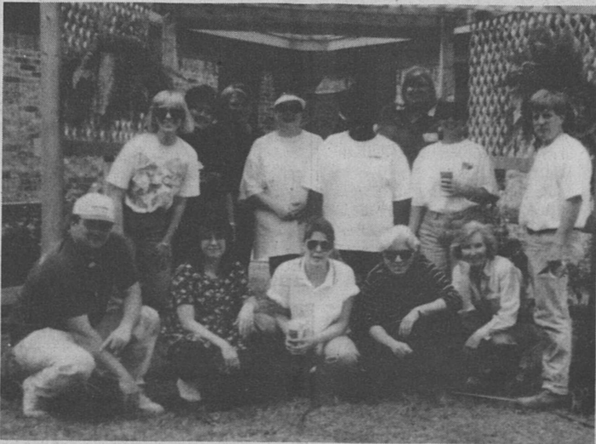
The Risk Management Group poses with their handywork.